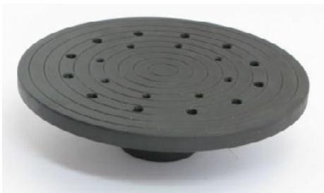
Mec23-196-Af30-St-20xM8 Steel plate with M8 thread