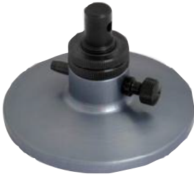
Mec23-116-Af159-Al with additional adapter MecS626-158-158

Examples for other versions and special solutions