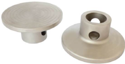
Mec23 nickel plated

For more information on QC fittings, refer to datasheet 431-354 Adapters for QC range of grips.