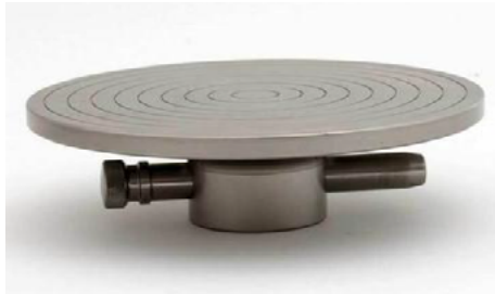
Mec23-156-Af38-Ni: Nickel plated steel plate