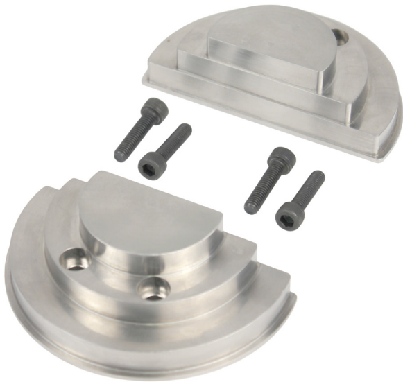
▲ 432-653 Cable tie fixture