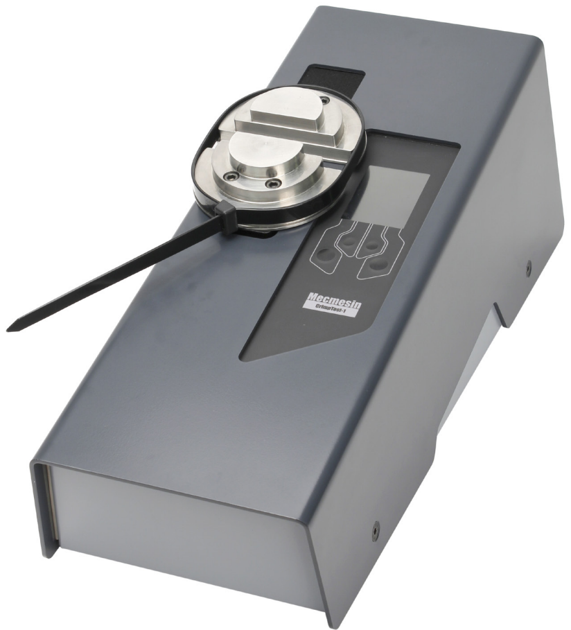
▲ Shown in use on the CrimpTest-1 kN